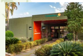
São Paulo, Brazil