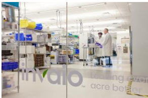
Cambridge, MA (HQ)