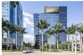
São Paulo, Brazil