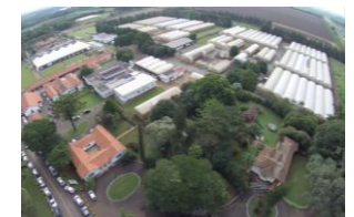
São Paulo, Brazil